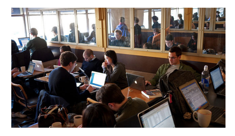
Unintended Outcome: The death of conversation?

If you doubt how quickly computing, communications tools and infrastructure have evolved to dominate the cultural fabric of our country, just drop by a coffee shop and look around the room.